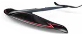
Manta Ray II