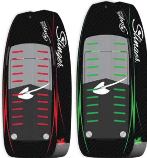
5'7 Red Rocket